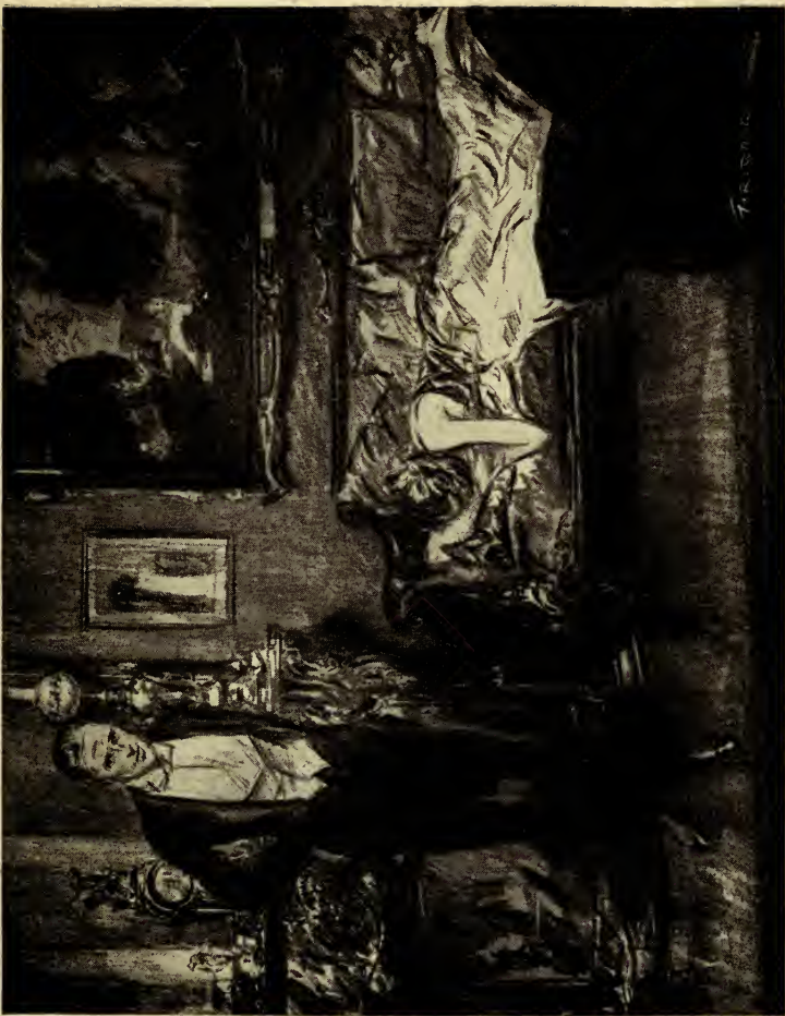
She flung herself face downward on the sofa and sobbed